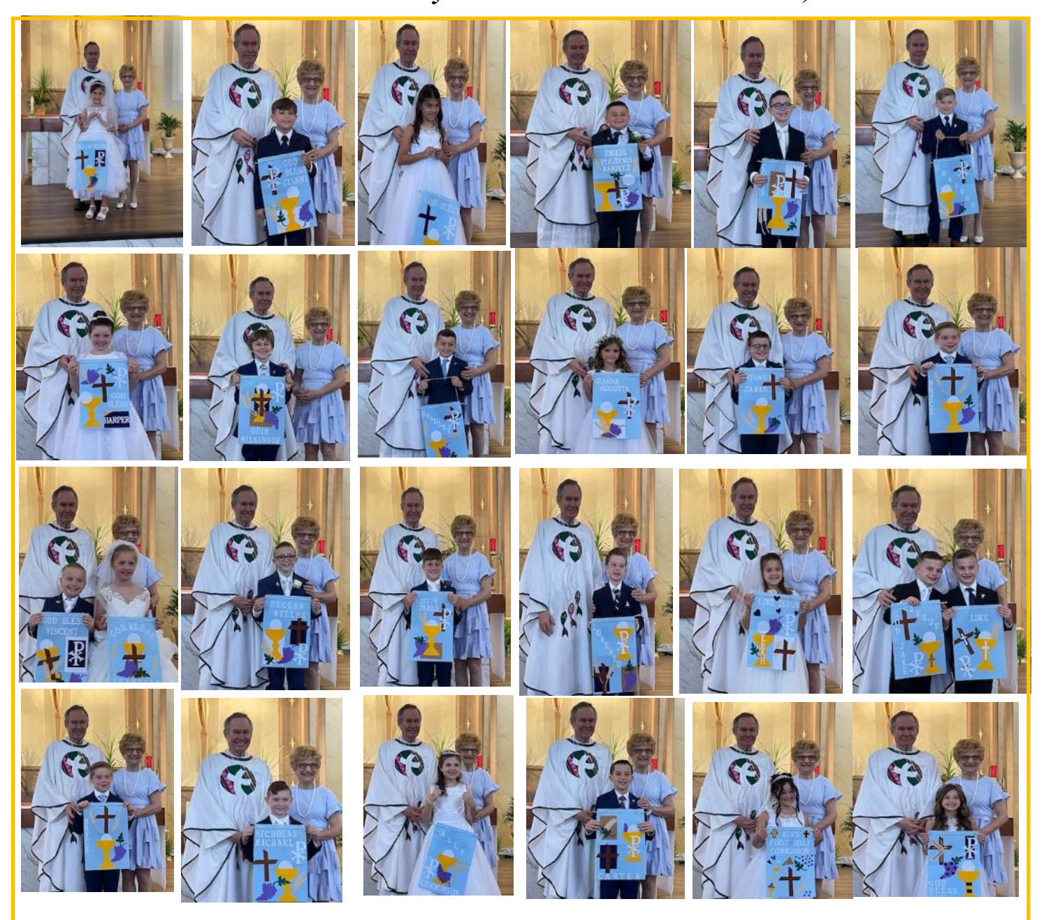
God's Blessings upon our First Holy Communion Students and their families: