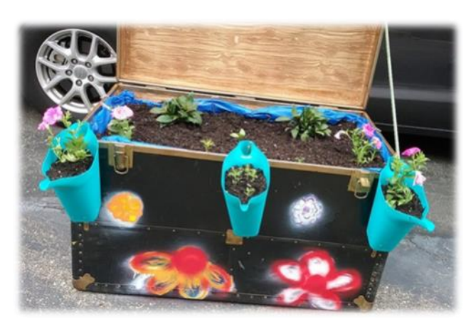
Photo of the innovative garden our sisters in Elmhurst, NY planted this spring

Till next week as we continue to speak life, Sister Theresita